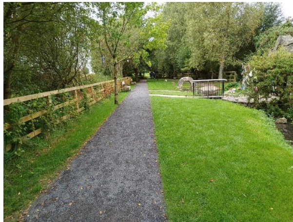
View Up Site from Entrance - After