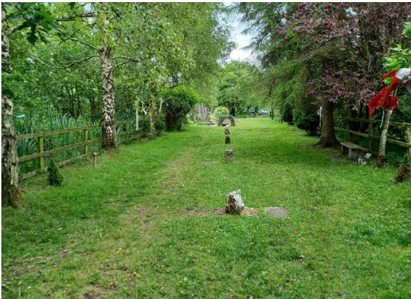
View down Site - Before