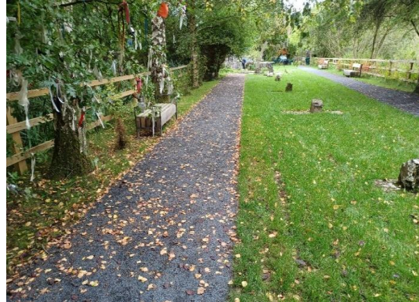
View down Site - After