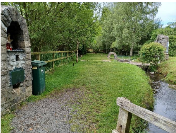
View Up Site from Entrance – Before